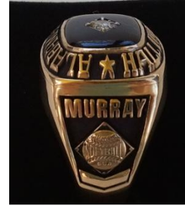
NAME ON RING