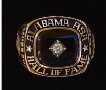
Sample is shown with Black Onyx inset w/CZ diamond. Birth Stone Colors Available